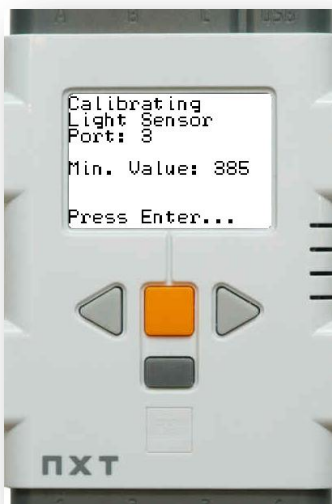
Figure 3: Position over black and press enter