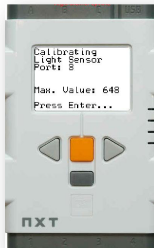
Figure 4: Position over white and press enter